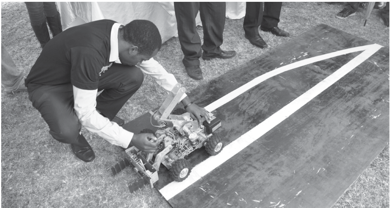
An engineering student demonstrating a robot at a recent exhibition