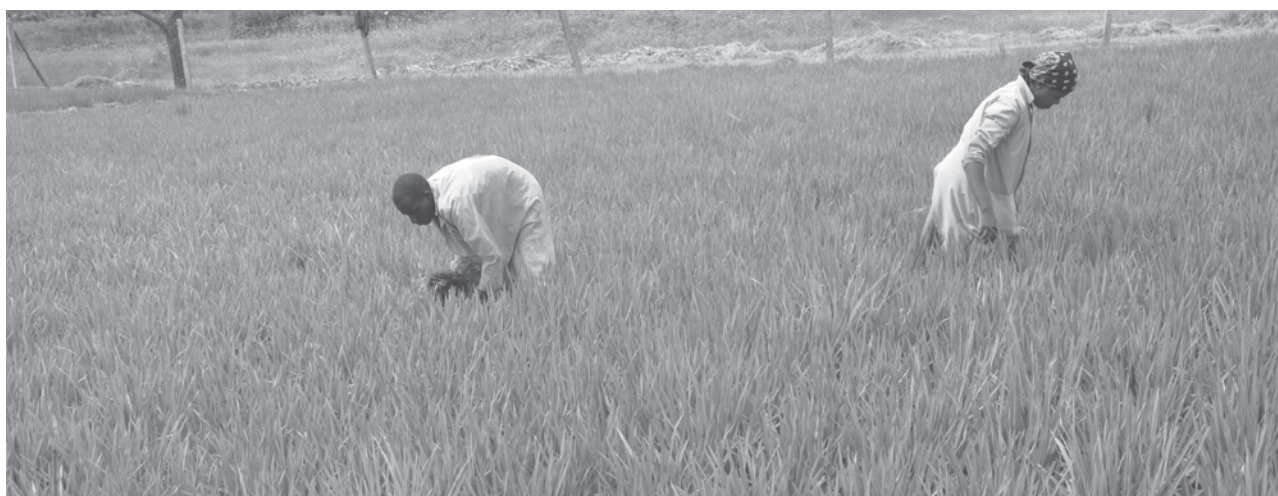
Rice demonstration farm at the main campus