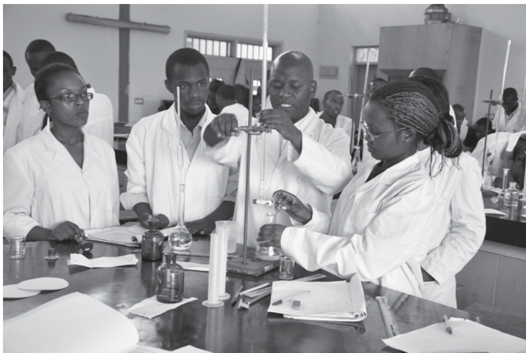
Students at a practical session

Topic: Environmentally cleaner utilization of cashew nut shell liquid (CNSL) as an industrial raw material in Kenya. Researcher(s): Patrick M. Mwangi Status of Research: On-going