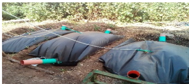
Fig. 1. Miniature biogas digesters set up at JKUAT

10 ml of the digested samples, blank and standard solutions were pipetted into 100 ml beakers and 10 ml of molybdivanadate solution added. To the resulting solution 25 ml of distilled water was added into each beaker, mixed and allowed to stand for at least 5 min. The percentage transmittance for each solution were measured at 430nm using a Shimadzu UV-Vis 1800.